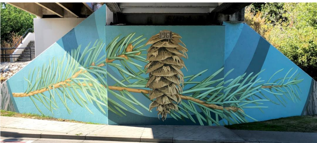
Helmcken Road Mural - West Side

Collin's botanical representations of Douglas Fir and Western Red Cedar, important tree species in this eco-region, are mirrored in the mural on either side of Helmcken Road.